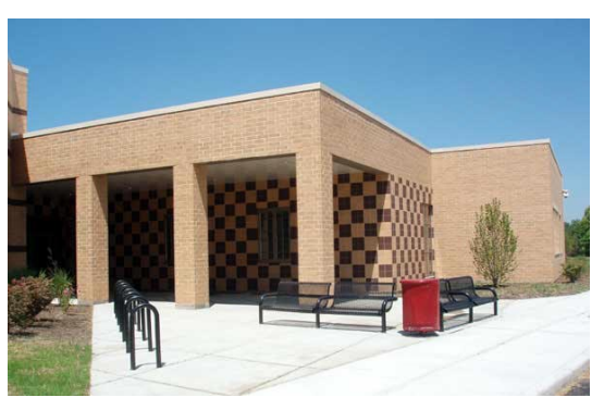
Madison Park Elementary School